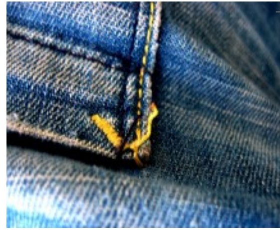
Save A Life, Distress Your Jeans