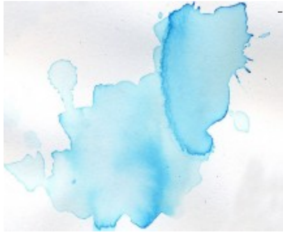
Remove Stains Naturally & Toxin-Free