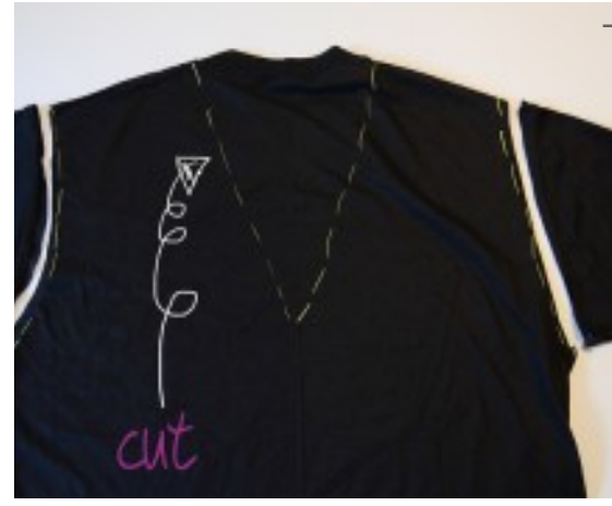
Upcycle Your Life