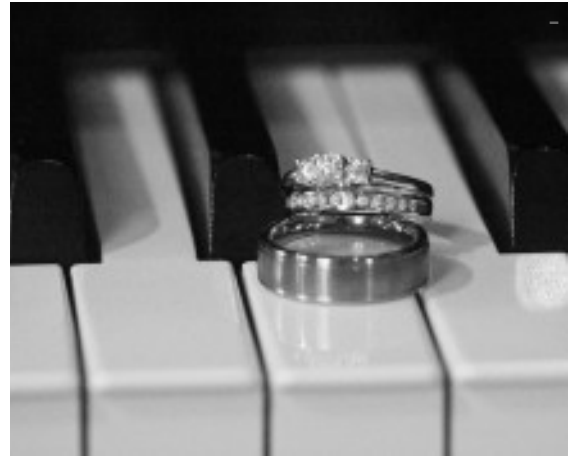
Be Conscious: Choose Conflict-Free Diamonds