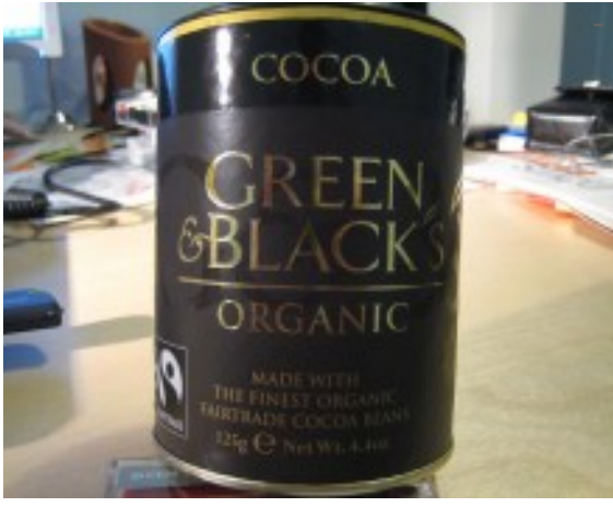
Give "Green" Chocolate this Valentine's Day