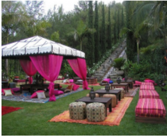
How to Throw a Low-Energy Party