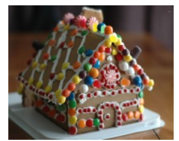
Upcycle Your Holidays, Help the Planet