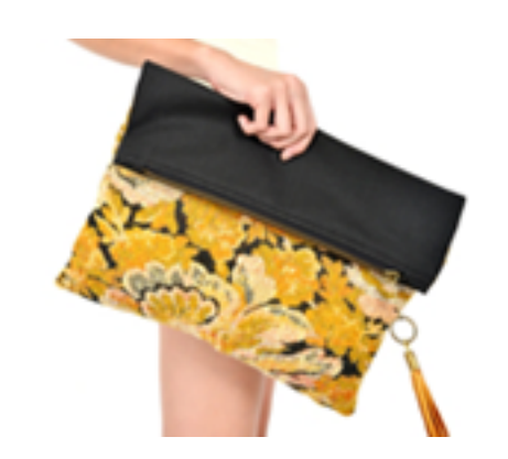
Shop all pretty in pastels