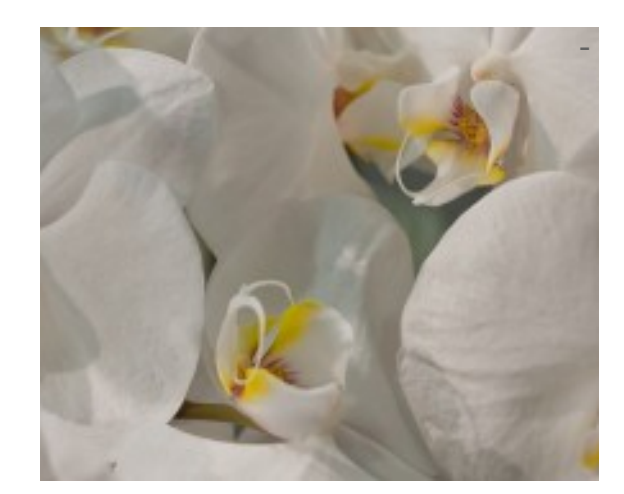
Fair Trade Flowers for Mother's Day