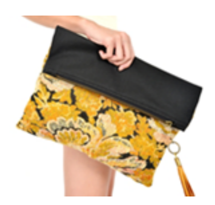
Shop all pretty in pastels