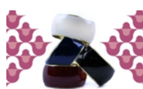
SHOP GLAMOUR SHOTS