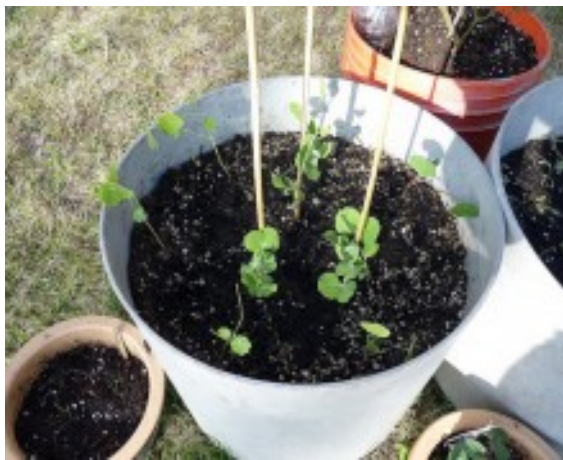
Get Your Kids Excited about Healthy Eating with Gardening