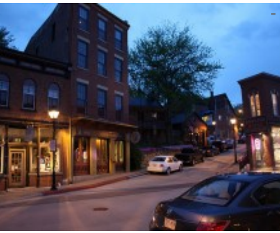
How to Find Local, Small Businesses