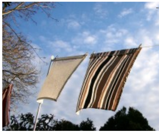
Eco-friendly Outdoor Clothes Racks