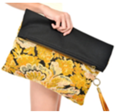
Shop all pretty in pastels