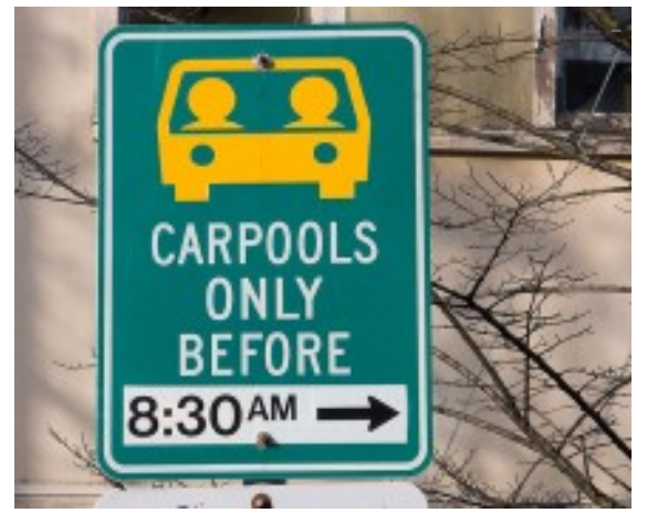
Rideshare to Save the Environment