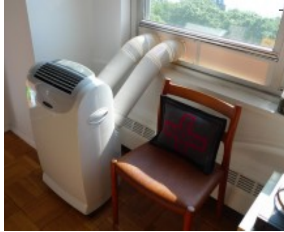
Right-Sized Air Conditioners Allows for High Efficiency