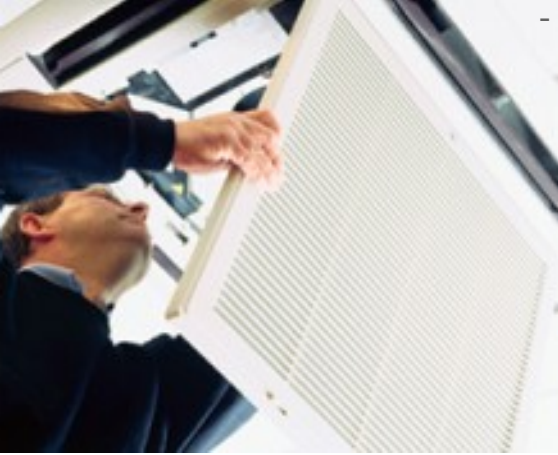
Regular Air Conditioner Maintenance for Saving on Home Energy Bills