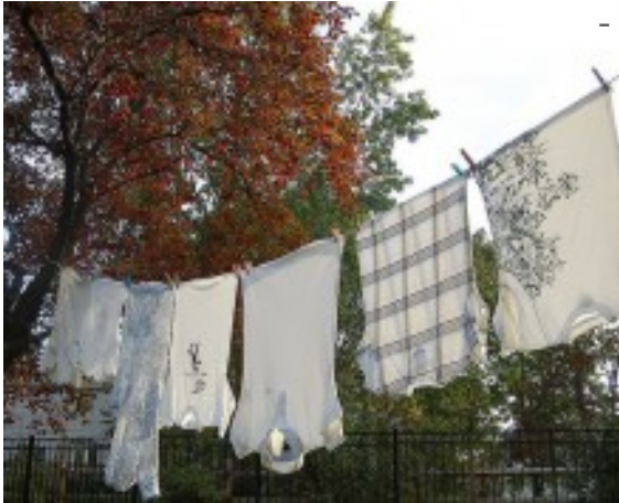
Fluff Line-Dried Laundry to Save Money and Energy