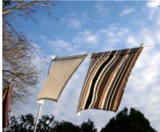
Eco-friendly Outdoor Clothes Racks